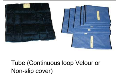
Tube (Continuous loop Velour or Non-slip cover)