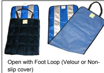
Open with Foot Loop (Velour or Non-slip cover)